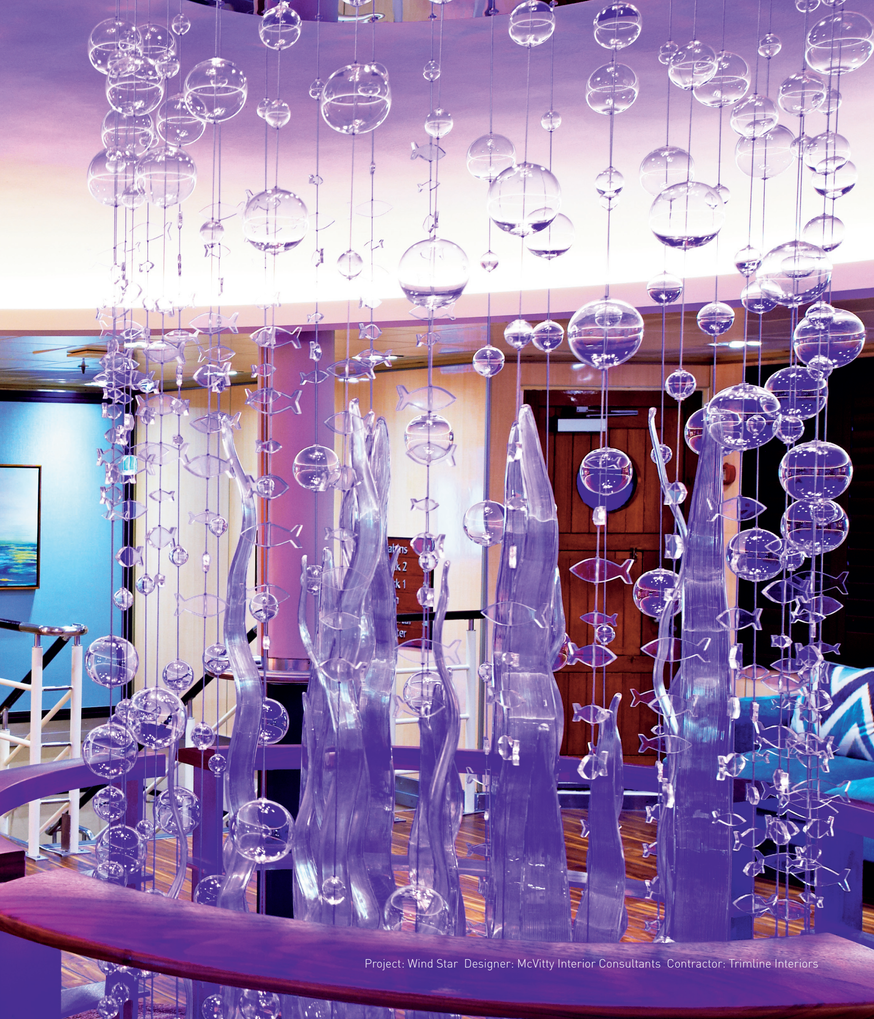
Project: Wind Star Designer: McVitty Interior Consultants Contractor: Trimline Interiors